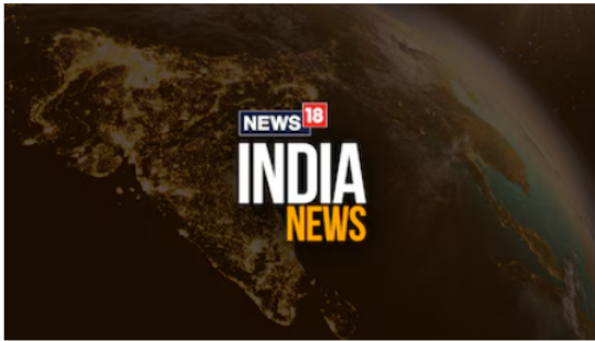
Representational image

New Delhi [India], December 14 (ANI): REC Limited, a government-owned power sector company, has finished an independent check to confirm that the money it raised through its green bonds was used properly for environmentally friendly projects. These bonds include USD 500 million raised in September 2024 and about JPY 61 billion raised in January 2024, both issued under its green funding