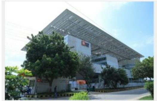
REC Limited HQ building

New Delhi, India, December 2025– REC Limited, a Maharatna Central Public Sector Enterprise under the Ministry of Power, Government of India, has successfully completed post-issuance assurance for its Green Bonds worth USD 500 million (ECB 74) issued in September 2024 and JPY 61.10 billion (ECB 66) issued in January 2024 — under its Green Finance Framework.